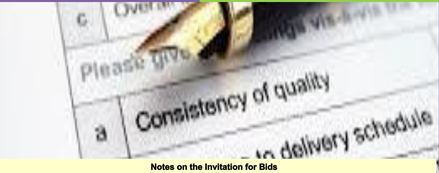
Notes on the Invitation for Bids

The Invitation for Bids (IFB) shall be issued as an advertisement in at least three newspaper of general circulation in the Province of Sindh or Authorities web site as the case may be, allowing at least fifteen days for NCB and thirty days (30) ICB for bid preparation and submission;