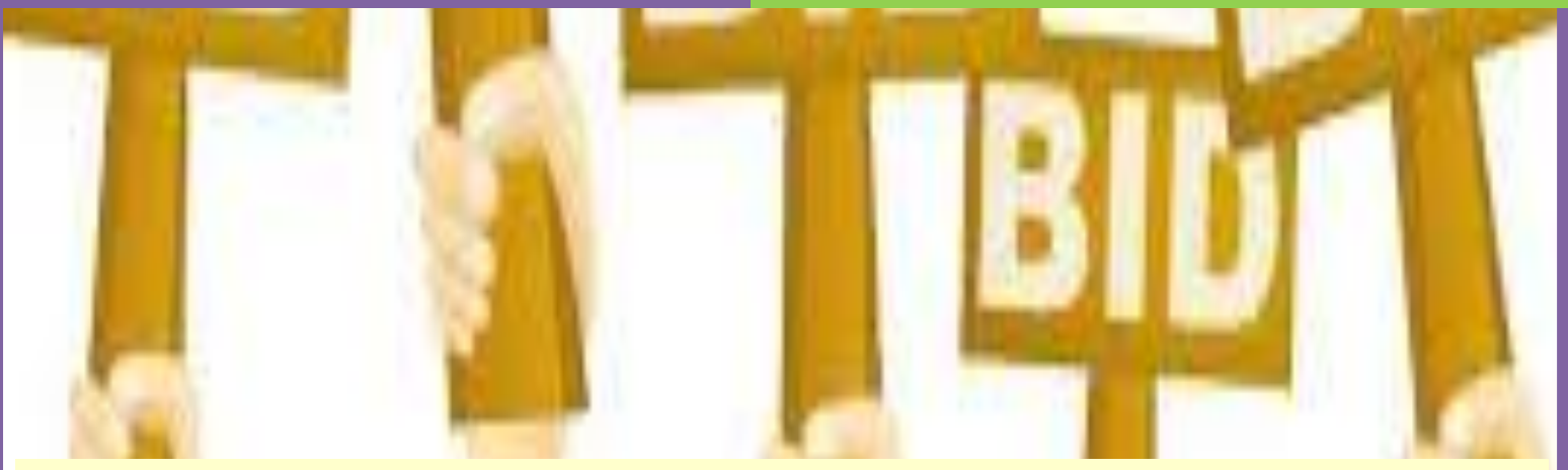
Notes on the Bid Data Sheet

Section II is intended to assist the Procuring agency in providing the specific information in relation to corresponding clauses in the Instructions to Bidders included in Part one Section I, and has to be prepared for each type of procurement.