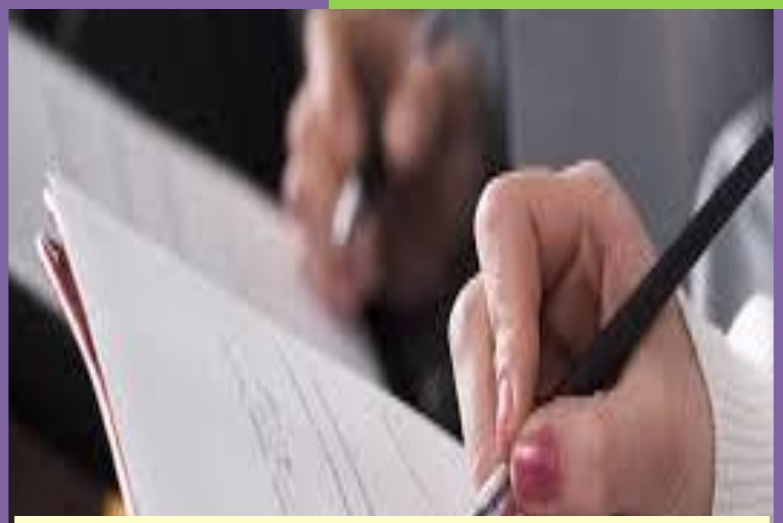
Notes on the Sample Forms

The Bidder shall complete and submit with its bid the Bid Form and Price Schedules pursuant to ITB Clause 9 and in accordance with the requirements included in the bidding documents.