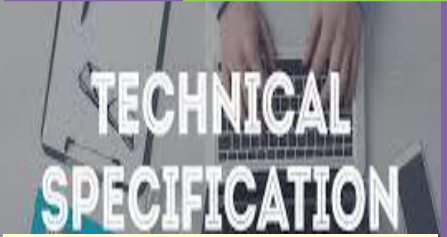
Notes for Preparing the Technical Specifications

Care must be taken in drafting specifications to ensure that they are not restrictive. In the specification of standards for equipment, materials, and workmanship, recognized international standards should be used as much as possible. Where other particular standards are used, whether national standards of the Borrower's country or other standards, the specifications should state that equipment, materials, and workmanship that meet other authoritative standards, and which ensure at least a substantially equal quality than the standards mentioned, will also be acceptable. The following clause may be inserted in the Special Conditions of Contract or the Technical Specifications.